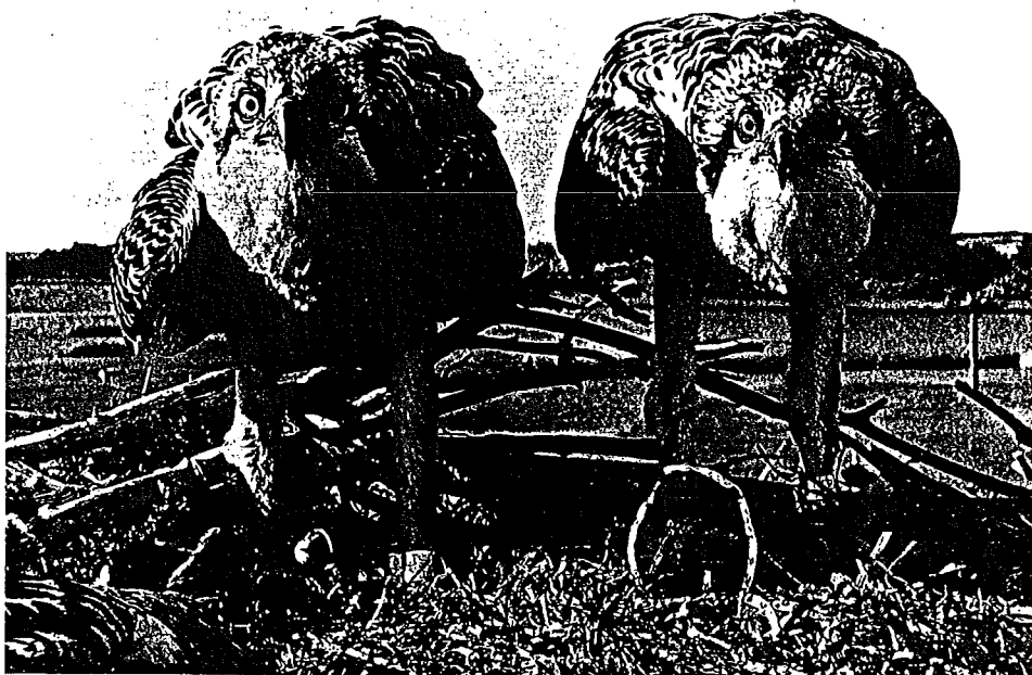
Ospreys at the nest platform.

Despite the good production of Ospreys along the Atlantic coast, production in Salem County on Delaware Bay has been consistently low. The nine year production average (1985 through 1993) in Salem was 0.87 young per active nest, and has infrequently reached 1.0 young per nest, indicating an unstable population. The number of active nests in Salem has also declined after a high in 1984, perhaps related to poor production