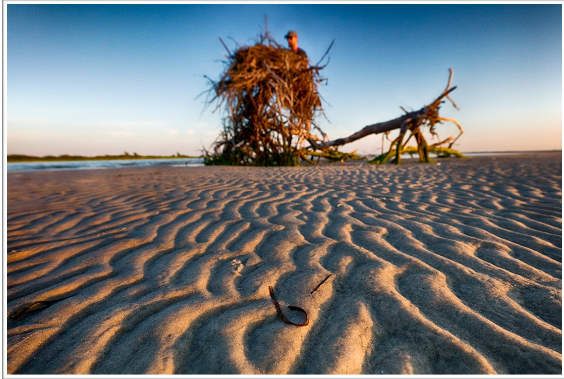
Ben Wurst checks a new “natural” nest inside Barnegat Inlet.

Cold temperatures and heavy rain in late April-early May (during hatching) can lead to reduced productivity (as seen in 2003), but this was not a factor this year. Weather was optimal for nesting ospreys; temperatures in the spring were warm (third warmest May on record) and dry (third driest on record). Precipitation was above normal in June but did not seem to affect nest success. Ever since the derecho hit in late June 2012 we have been keen to watch these high wind storm events during summer months. This summer, one strong storm hit on June 23. It had high winds (around 70mph) which can blow young from nests. We conducted one survey in the Barnegat Bay area in the following days and found only five young that had fallen from nests (at three different nests). Two young were found alive and were placed back into their nest and the other three were unfortunately found dead. From these strong storm events we’ve learned that it is extremely important to remove excessive nesting material on platforms. This allows birds to build a deeper nest bowl and it also reduces stress on aging platforms.