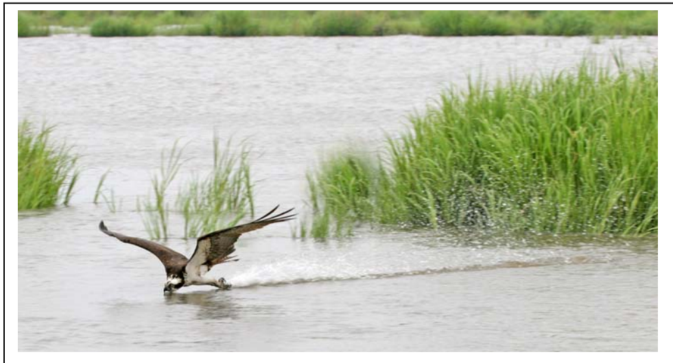
An adult osprey showing its aggression by dragging its feet in the water while its young were being banding.

Thanks to everyone who contributes to the Endangered and Nongame Species Program through the Check-Off for Wildlife on their NJ State Income Tax, and by buying Conserve Wildlife License Plates!