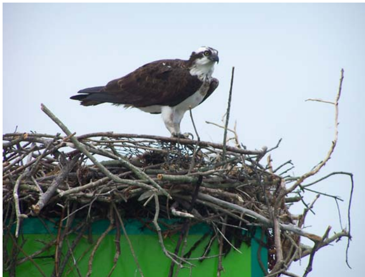
Banded breeding adult nesting on channel marker in Cape May Harbor in 2007

*Thanks also to everyone who contributes to the Endangered and Nongame Species Program by the Check-Off for Wildlife on their NJ State Income Tax, and by buying Conserve Wildlife License Plates!*