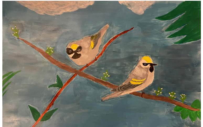
Golden-winged Warbler by Lily Ryan 2024 Winner from Sussex County

Contest is FREE to enter and open to ALL fifth graders in New Jersey! Please review the contest kit carefully to be sure your submission is considered. Entries due 2/20/ 2025.